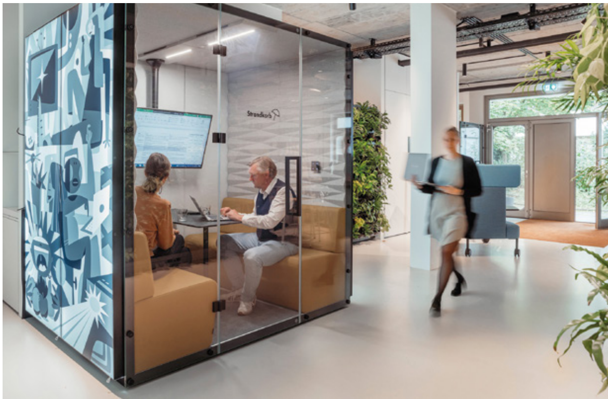
INTERIOR DESIGN / CLIENT: workingwell, MUNICH