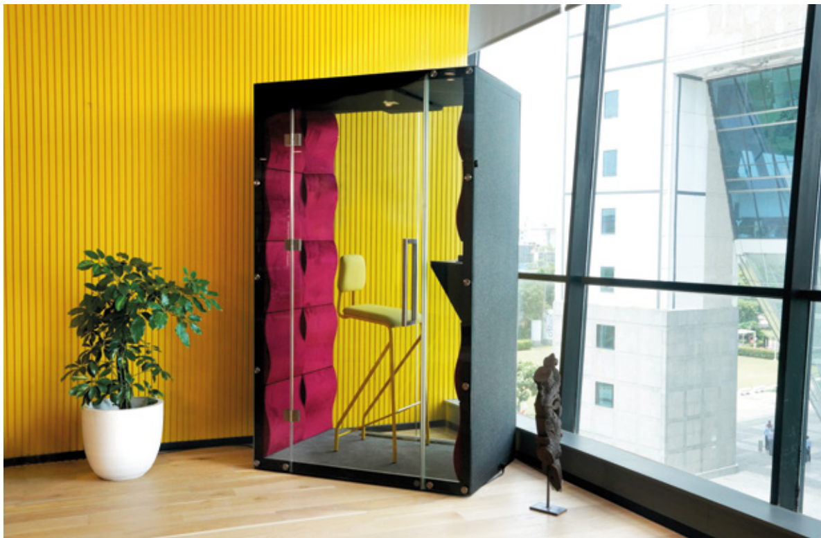
CLIENT: NESTLE, INDIA INTERIOR DESIGN: SPACE MATRIX