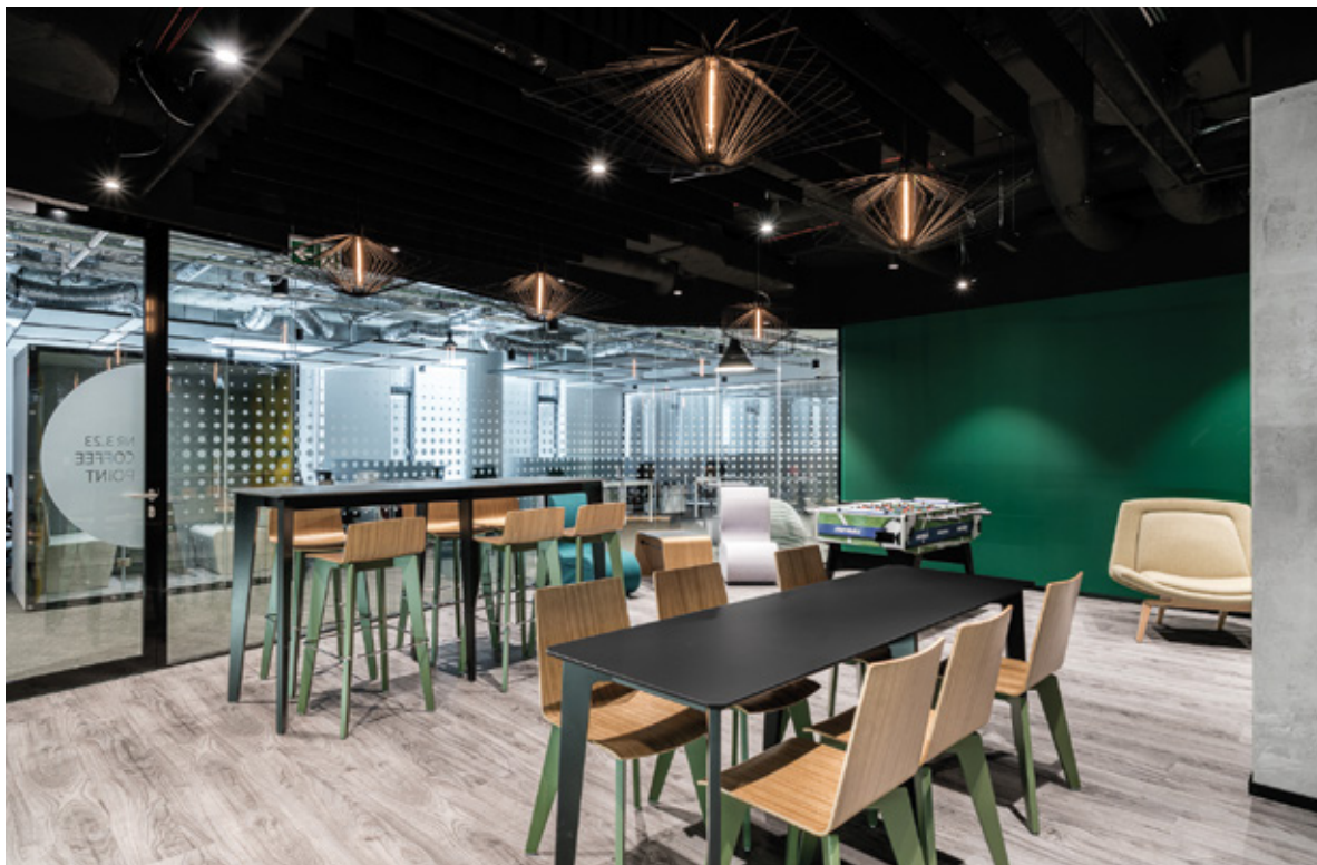
CLIENT: SANTANDER BANK POLSKA, POLAND INTERIOR DESIGN: THE DESIGN GROUP